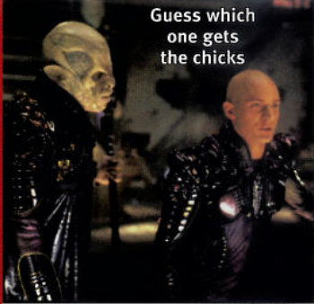
Guess which one gets the chicks

A BALD-headed captain of a spaceship is called into the neutral zone where there's a treaty violation... Earth under threat... shouting villain... blah, blah, blah. Strip away the last 20 minutes of "shields are down 20 per cent, Captain"-type action, and all you've got is 90 minutes of space-wrangling in rooms with blinky lights. IS ★★