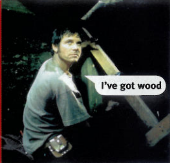
I've got wood

TWO brothers' cosy family life takes an unexpected change of pace when Dad starts hacking people up with a big axe. A tightly bound terror straight out of the Bible Belt, it'll make you glad your own dad sticks to griping about music today and the price of petrol. IS ★★