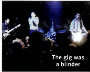
The gig was a blinder

WE'VE all considered dumping a borry in a hardware store or, er, shoving a toy car up our arse before getting an X-ray, but none of us has actually gone through with it, right? Wrong. The Jackass crew cram in 90 minutes worth of idiotic real-life stunts that will make you cry from cacking yourself stupid. Just remember to breathe. GD ★★★★★