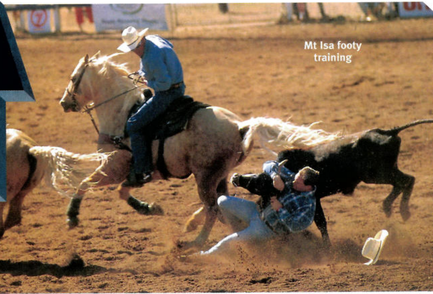
Mt Isa footy training

✓ IF IT GOES RIGHT WRESTLING? Mugging, more like. The cowboy leaps off his horse onto the horns of a runaway 200kg steer and uses his momentum to flip it over. The clock stops when the steer is on the ground and all four hooves are pointing in the same direction.