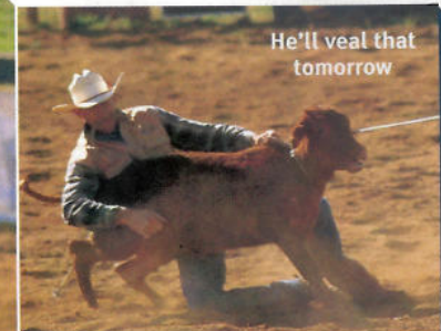
He'll veal that tomorrow

✗ IF IT GOES WRONG EITHER the rope misses the calf; the string comes loose; or the horse starts dragging the helpless calf around in an amusing manner. The RSPCA has reservations about the long-term mental effect on the calf.