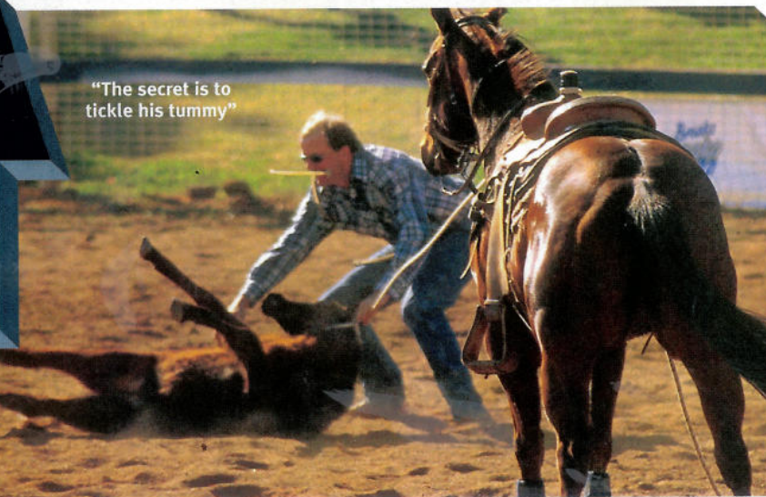
"The secret is to tickle his tummy"

✓ IF IT GOES RIGHT THE calf gets a short head start before a bloke on a highly trained horse chases, ropes it, jumps down and physically dumps it on its side like a roll of mooring carpet. He ties three hooves together with a bit of string and he's done. This should take less than 10 seconds.